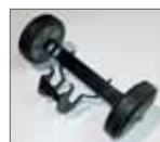
High travel speed with improved foot inclination angle, optimized spring systems and low centre of gravity.