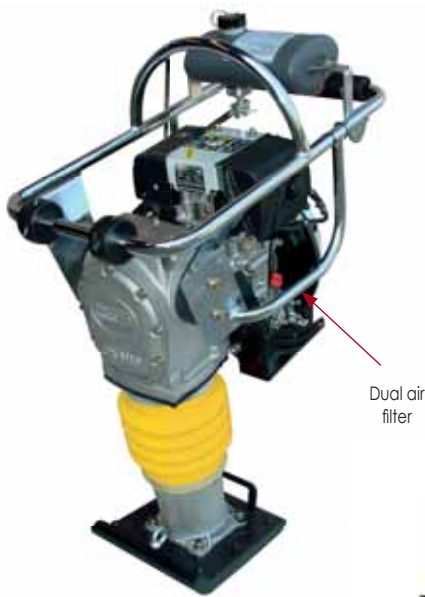
Dual air filter