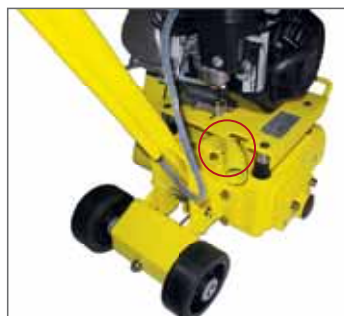
Outlet for dust collector