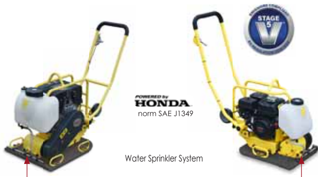
Water Sprinkler System