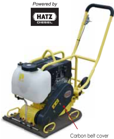
Carbon belt cover