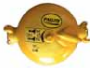
External oil lubricator Code: PAC-LUB