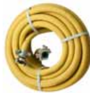
Hose for compressor Code: PAC-HOSE