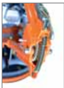
Innovative spring folding arm