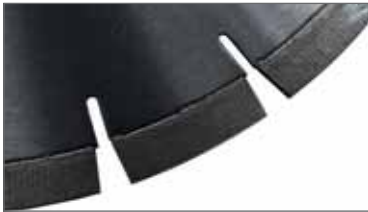
ARIX QUALITY For reinforced concrete

The PACLITE range of high-performance diamond saw blades are one of the fastest and most productive saw blades on the market.