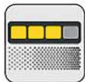
Operating handle with integrated electronic controls

All models provide excellent compaction performance.