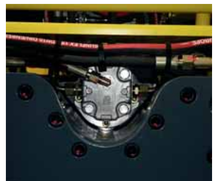
Sauer Danfoss Vibration motor