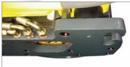
Reinforced thick frame

All PACLITE models are ergonomically designed and comfortable.