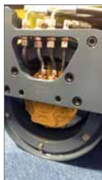
Two hydraulic Poclairn pumps