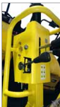
Dual amplitude control panel

All models provide excellent compaction performance.