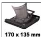
Interchangeable rammer shoe