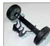
Wheel kit OPTION