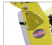
Max blade diameter 450 mm