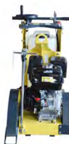
Water tank 25 L