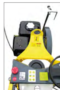
Central lifting point