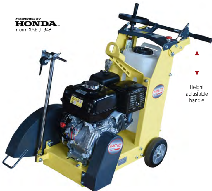
Height adjustable handle