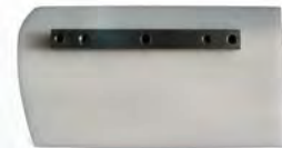
Polypropylene plastic blade for epoxy