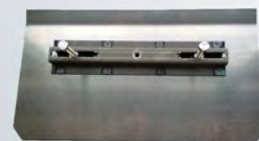
Adjustable combination blade