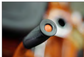
Electric spray system in handle