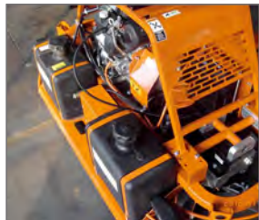
Two water tanks