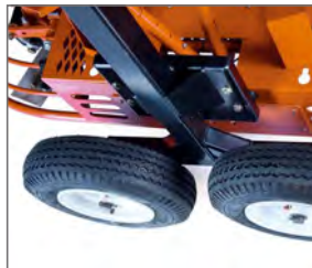
Transport wheels 'Dolly jacks'