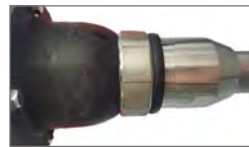
Low hand-arm vibration handle