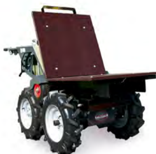
Flat tray always included