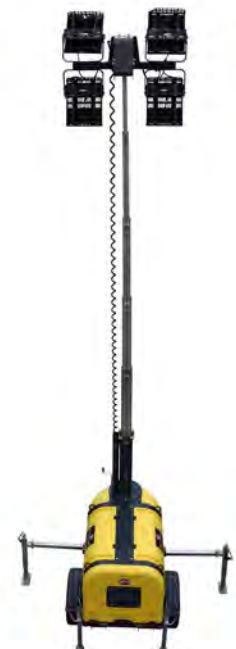
Hand brake and height adjustment