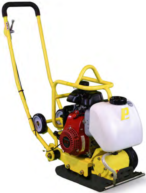
Ultra compact design

Designed for repair in confined areas. These plates are ideal for curbs, gutters, block paving around houses, tanks, forms, columns, footings, guard railings, drainage ditches, gas and sewer lines, and building works.