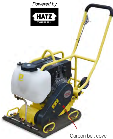
Carbon belt cover