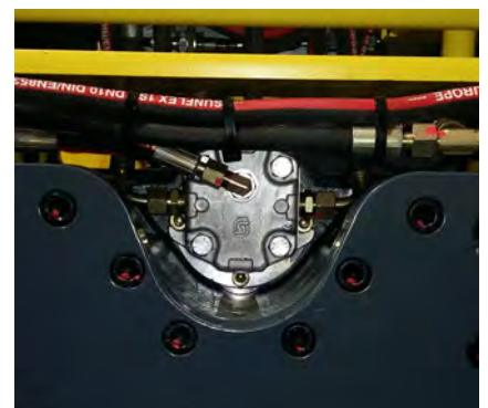
Sauer Danfoss Vibration motor