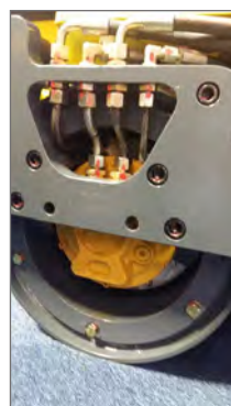
Two hydraulic Poclairn pumps