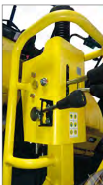
Control panel with double amplitude

Excellent performance of compaction of all our models.