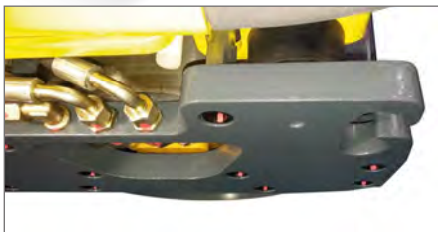
Reinforced thick frame

All PACLITE models are ergonomically designed and comfortable.