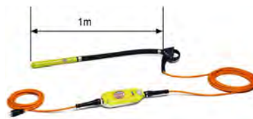
OPTIONS: Special length of 8 or 10 meters operational hose available upon request.