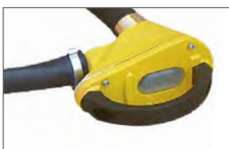
VX (D) version (Ergonomic handle for floors)

Manufactured under standards: EN 60745-2-12:2003 EN 60745-1:2003