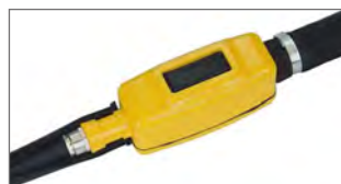
PACLITE improves quality components and tests them to the limits. ERP insulated polyurethane sheathed flex cable * Top Flex*