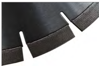
ARIX QUALITY For reinforced concrete

ARIX TECHNOLOGY: concrete-steel 'Cuts anything': concrete-steel-asphalt Continuous Rim. For a smooth cut with sharp edges (no chips) choose a Specialist blade for hand and tile saws.