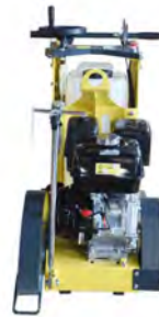
Water tank 25 L