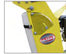
Max blade diameter 450 mm