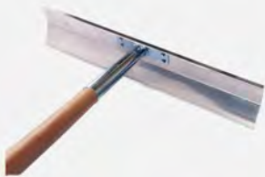
TEXAS CONCRETE PLACER