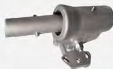
Snaplock extension handle Code : BT003300