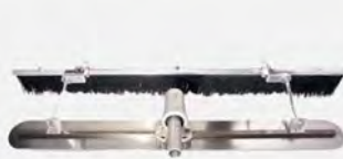
FRESNO WITH BROOM