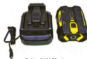
Battery 5 (A) 70 min