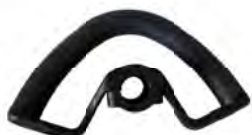
Low hand-arm vibration handle