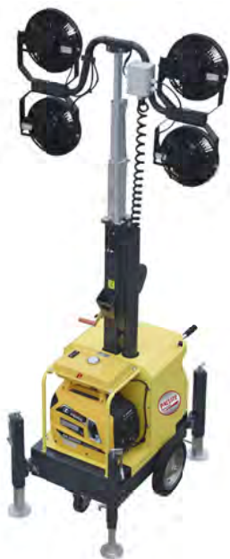
PLUG-IN & GO HYBRID