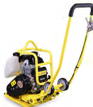
Transport wheels included