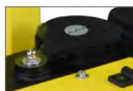
Improved water tank 47 L