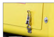
Easy opening hood