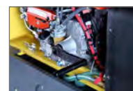
Manual start on KUBOTA model