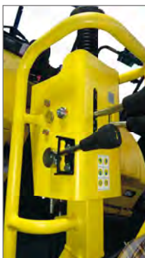
Control panel with double amplitude

Excellent performance of compaction of all our models.