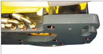
Reinforced thick frame

All PACLITE models are ergonomically designed and comfortable.