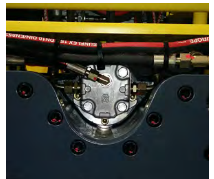
Sauer Danfoss Vibration motor