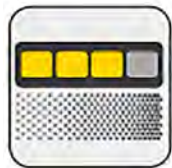
Operating handle with integrated electronic controls

Excellent performance of compaction of all our models.