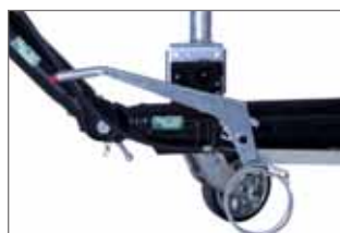
Hand brake and height adjustment