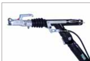
Option : tow brakes