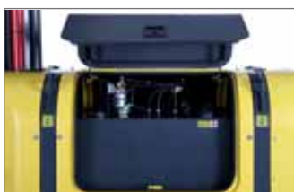
Service hood, carbon components to reduce weight