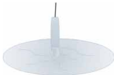
The influence of Zone is determined by the diameter of vibrator head.