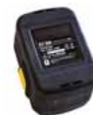
x 2 batteries B1840

Transport case + 2 batteries + 1 battery charger