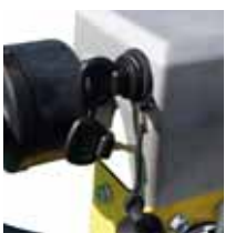
Handle with integrated electric starter box