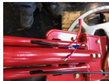
Remove the wire harness at the bottom handle slot