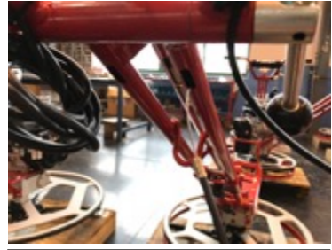
Insert the throttle cable into the slot at the back of the top handle