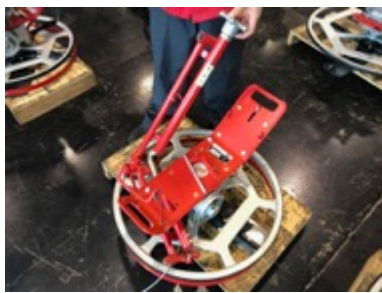
Remove handle from machine