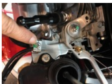
Tighten the throttle cable onto the engine