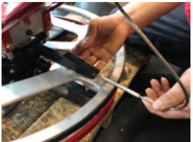
Slot the depth control cable into the tilt yoke