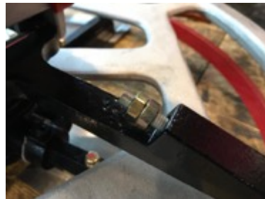
Attach the 2 FN.N-M6-DIN-1 nuts onto the depth control cable