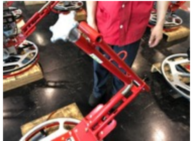
Put the handle into this position