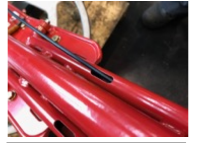
Remove the throttle cable at the bottom handle slot