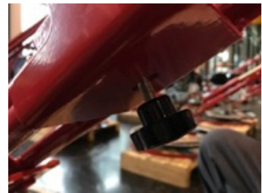
Tighten the star grip knob on the top handle