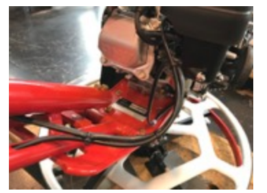
Use the cable tie that is found on the manual packing to tie up the throttle cable and wire harness