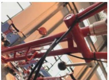
Insert the wire harness into the slot at the back of the top handle