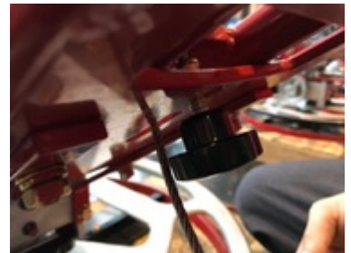
Tighten the star grip knob on the bottom handle