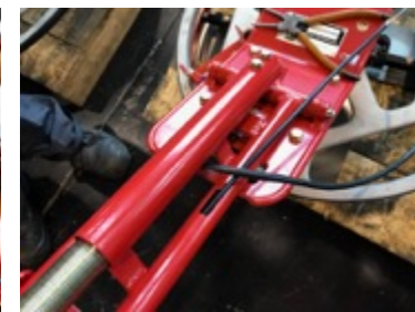
Cross the wire harness over like this