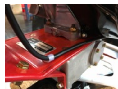
Make sure that the wire harness pass through the wire clip