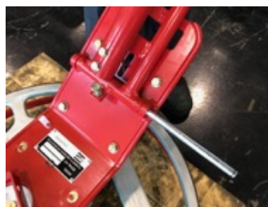
Attach the bottom handle onto the engine base and insert the pin into it.