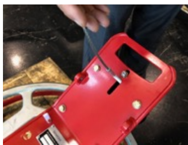
Put the depth control cable into the slot