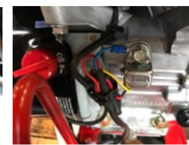
Attach the wire harness onto the engine