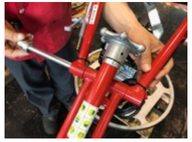
Attach the handle onto the top handle and insert the screw-tommy bar into it and tighten it